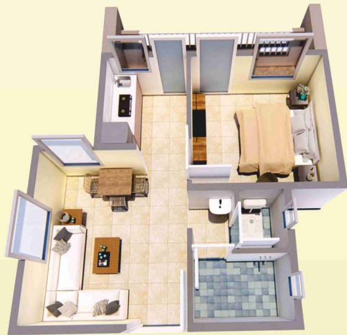
Type- I & II*